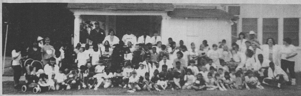
Those participating in the Living Hope Church Vacation Bible School gathered for a group photo just before the rain drove them back indoors last Friday.